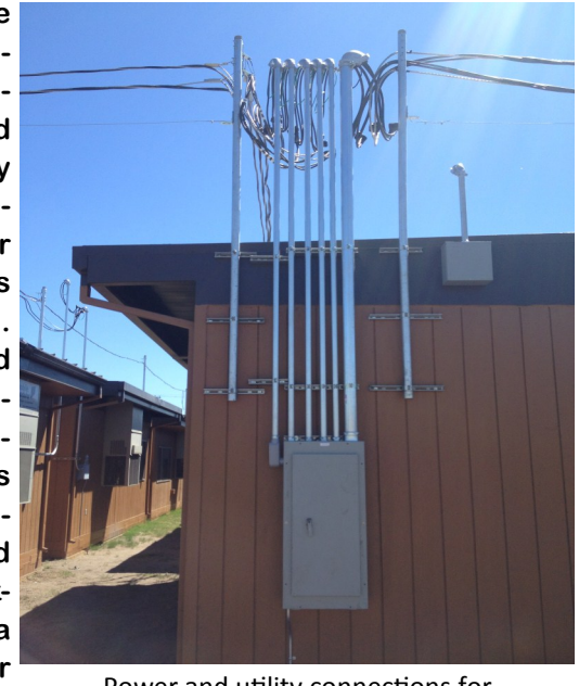
Power and utility connections for Interim Housing

accessible sinks, drinkfouning tains and cabinetry either replaced or modified as needed. High speed wireless Internet access points and additional hard wired network data drops for connectivity will be in-