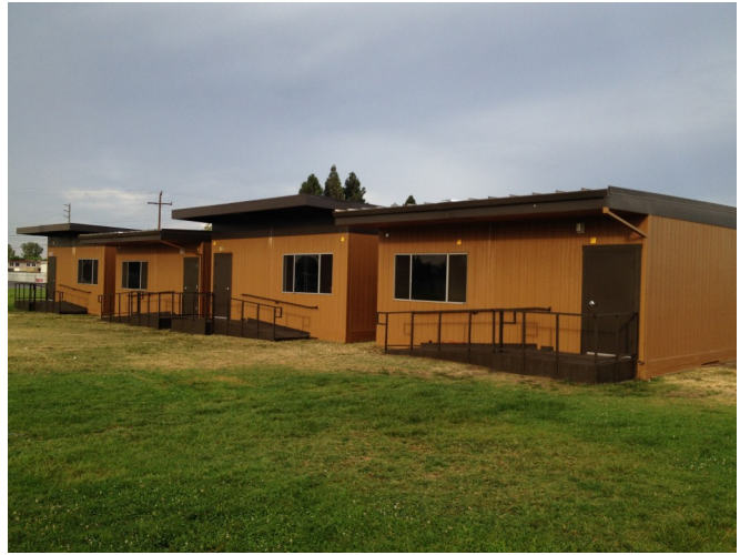
Interim Housing Portable Classrooms

The scope of work for the modernization of Jordan Intermediate can be categorized into four general areas. The first category is issues dealing with needed upgrades and improvements to the fire detection system and other safety related problems