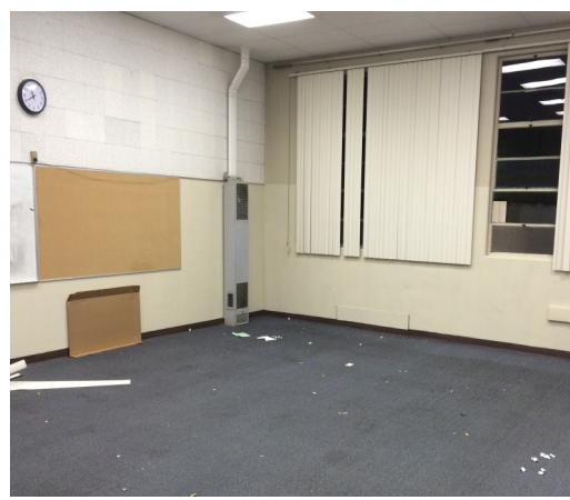
Existing classroom awaiting Modernization start

The first phase of modernization begins in December with work in buildings B1, B3, B5, B6 and the demolition of an existing portable, C7. The Cafeteria,