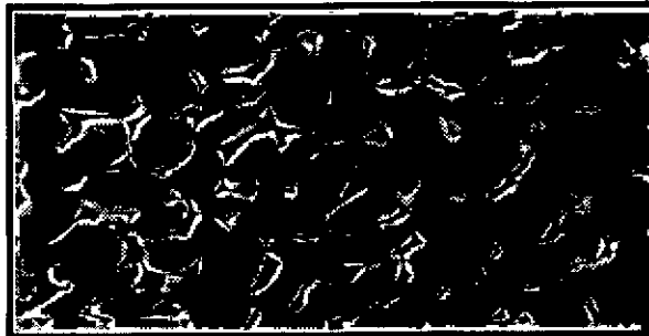
Typical Appearance of Briquettes

The Pulsar® Plus Dry Chlorinating Briquette product is dry solid calcium hypochlorite mixture, compressed into a unique rounded pillow shape and hardness, containing a phosphonobutane carboxylic acid salt additive blended into the product as a scale inhibitor.