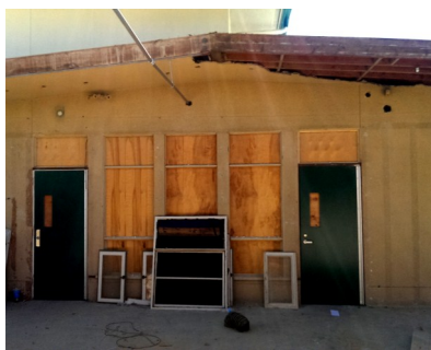
Demolition of office workroom

With the close of the 13/14 school year, extensive renovation began at three major areas of use. The administration building has undergone extensive demolition of old flooring, replacement of doors and door hardware including thresholds. Cabinetry was refurbished, new flooring installed and all interiors received a fresh coat of paint. Demolition of an office workroom is also being done this summer as the workroom was not code compliant.