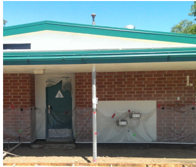
Prep work for concrete pour

The second phase of construction began in early July and will take approximately two months to complete.