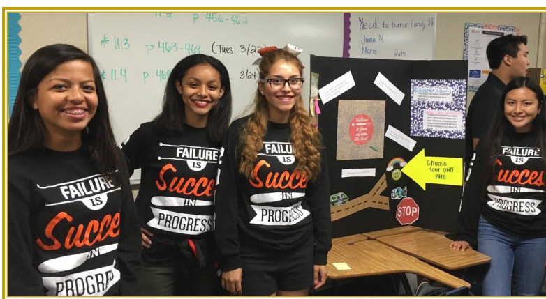
AVID students at Los Amigos High School