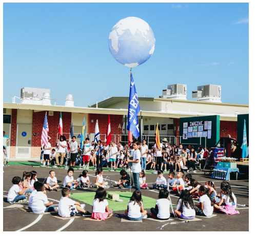
Carrillo Elementary School held a Peace Day Celebration to help combat bullying and promote acts of kindness throughout their school.

Gilbert, Hazard, Hill, and Zeyen elementary schools, along with Bell, Irvine, and Jordan intermediate schools, will join La Quinta, Pacifica, and Santiago high schools as the first schools in the district to provide the WeTip Service.