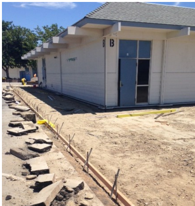
Prep work for path of travel

With the close of the 13/14 school year, extensive renovation began at three major areas of use. The administration building has undergone extensive demolition of old flooring, replacement of doors and door hardware including thresholds. Cabinetry was refurbished, new flooring installed and all interiors received a fresh coat of paint. Kindergarten classrooms are undergoing similar work including the renovation of student restrooms, new carpeting and flooring, cabinet refurbishment, paint, doors and hardware. The third area is the multi-purpose room with cabinet work, new doors and hardware, new fire alarms along with smoke and heat detectors. The existing flooring is in acceptable condition and does not need replacement. The fire alarm system will be up-