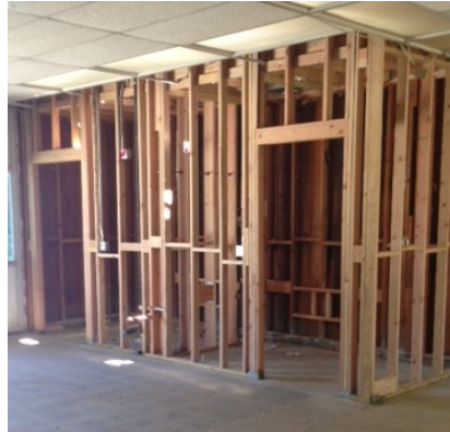
Framing of kinder restrooms

The second phase of construction began in early July and will take approximately two months to complete.