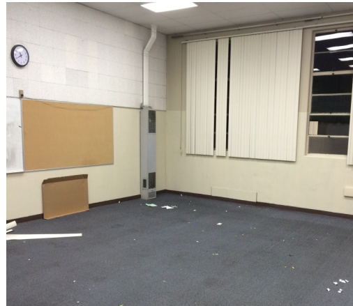
Existing classroom awaiting Modernization start

The first phase of modernization begins in December with work in buildings B1, B3, B5, B6 and the demolition of an existing portable, C7. The Cafeteria, building B2, is part of summer work.