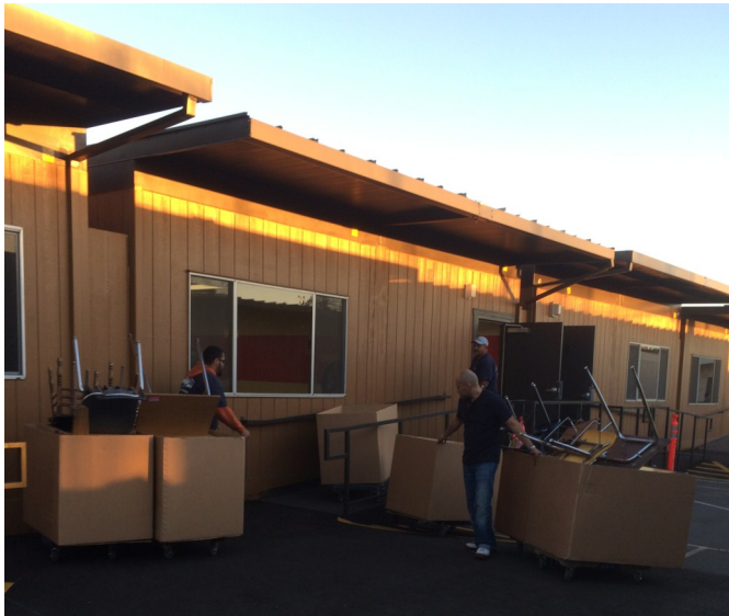
Move into Interim Housing Portable Buildings

During Summer, 26 relocatable classroom buildings and a portable restroom building were installed prior to the start of modernization. The setup of the portables