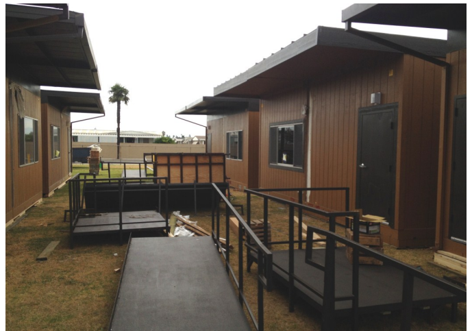
Setting up ramps for Interim Housing

work entails the renovation of eight classrooms and adjacent restrooms. These rooms will have new fire alarm systems complete with smoke detectors, heat detectors, strobes and alarms integrated into an automatic addressable system. In addition, the