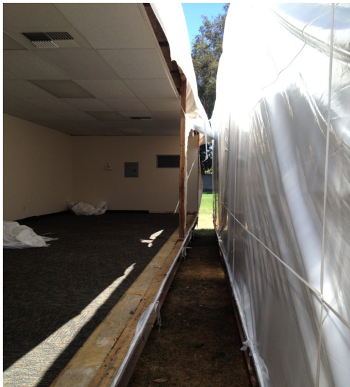
Interim Housing Delivery

The scope of work for the modernization of Doig Intermediate can be categorized into four general areas. The first category is issues dealing with needed upgrades and improvements to the fire detection system and other safety related problems needing correction. Secondly, the campus and buildings must comply with the Federal law commonly known as the "Americans with Disabilities Act" (ADA). Walkways may need replacement, doors need new hardware and must be of appropriate size, and drinking fountains need to be accessible just to name a few of the items that must be addressed.